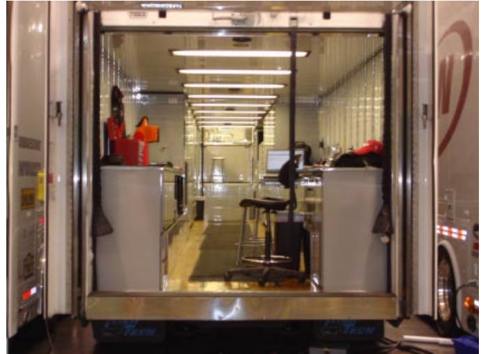
Half Million Dollar CART support trailer