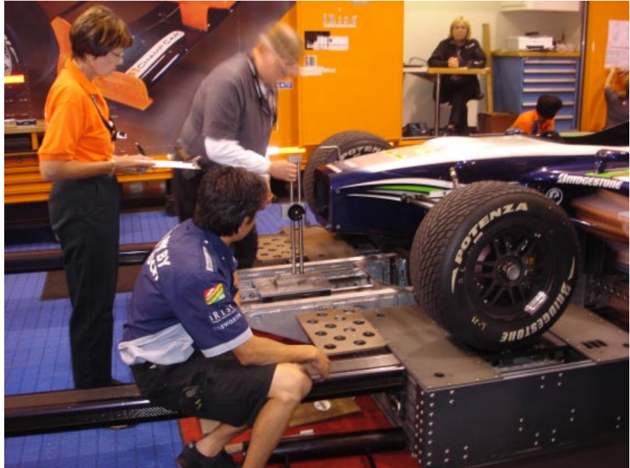
Tech inspection at the San Jose GP.

I'll have photos of the Historics, but miss the other events. If someone out there goes to Pebble or another one of the events, please take photos, write a short story and send it in. Or you're stuck with some photos of a trip up the Mekong Delta and into Cambodia, with Hendrix and the Doors playing in the background, another Asia trip, now through a purple haze.