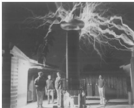
Wow! A real Tesla Coil and a box of homemade Brownies.....

Yes, electric is good and greenhouse gasses are bad. Unless